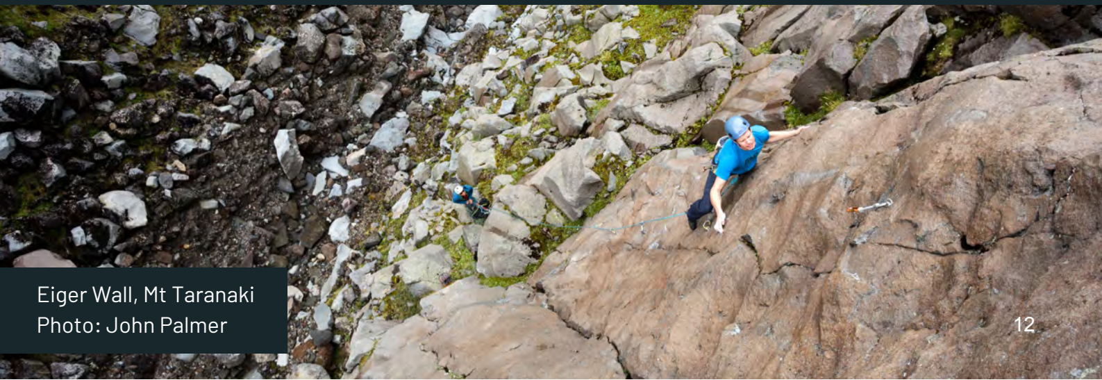
Eiger Wall, Mt Taranaki

Donors: To the many individuals who have made a one-off donation or bequest – thank you so much for your support.