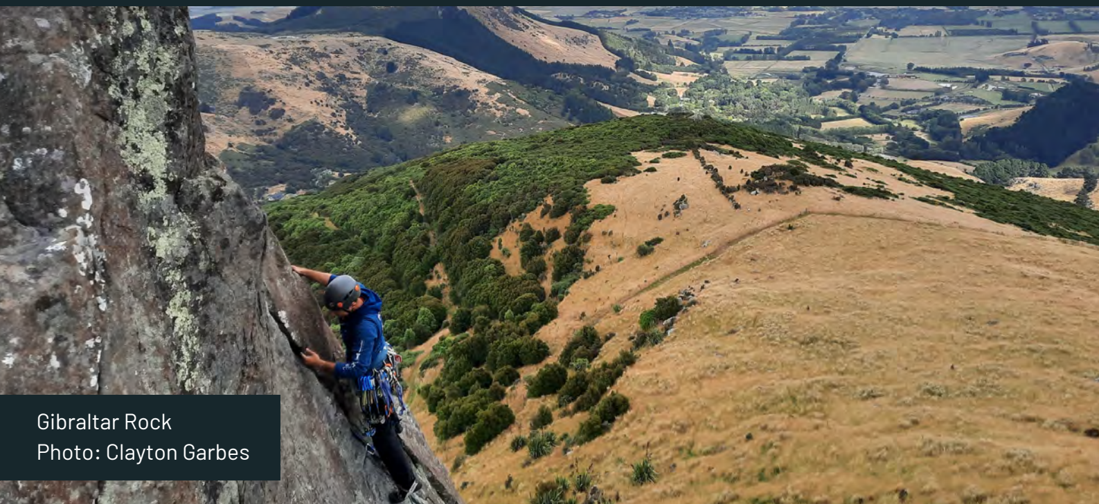
Gibraltar Rock

We have been working to put together a 'crag database' to identify access issues and opportunities in Canterbury, with assistance from the NZAC Canterbury-Westland Section and CMC.