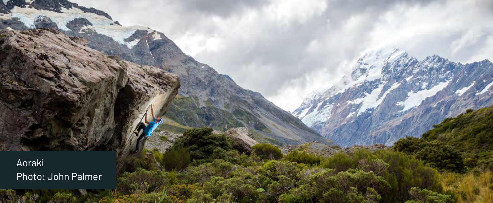
Aoraki