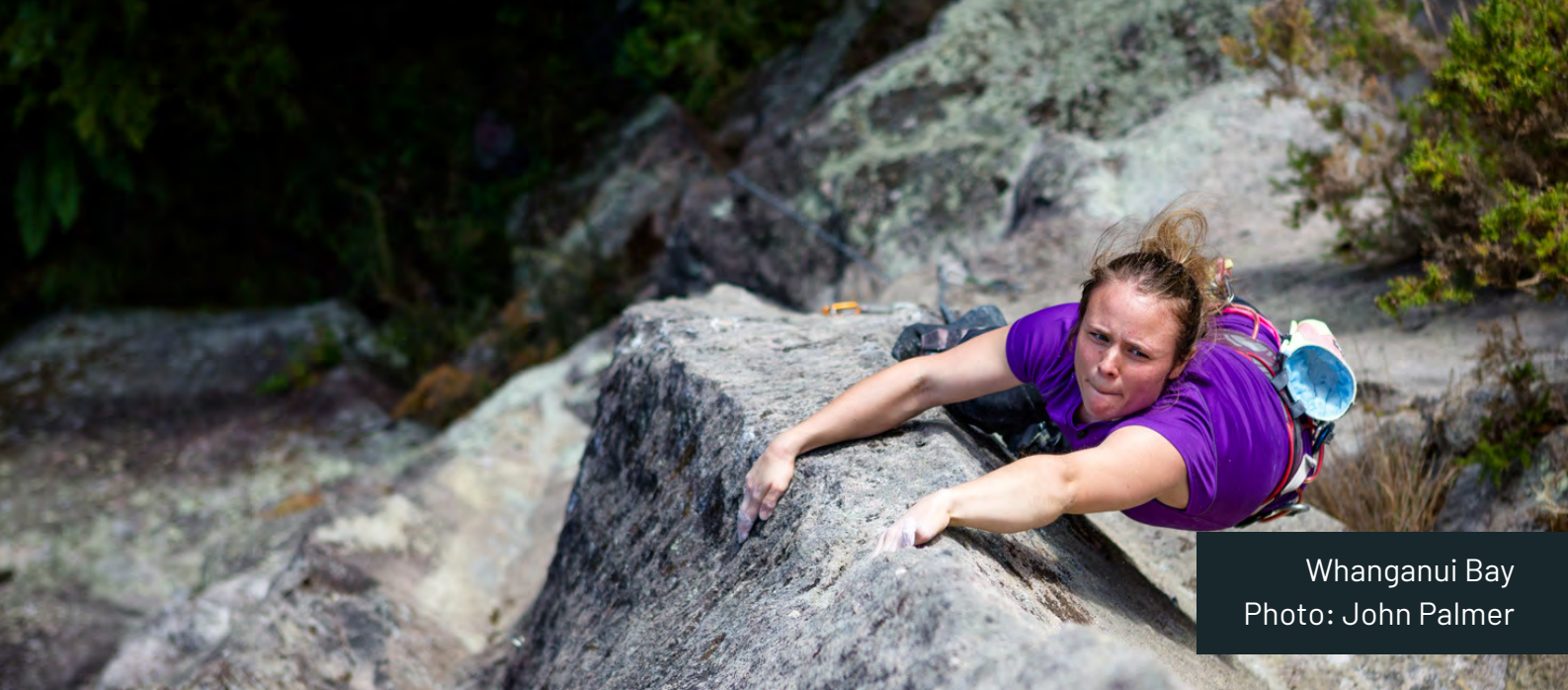
Whanganui Bay