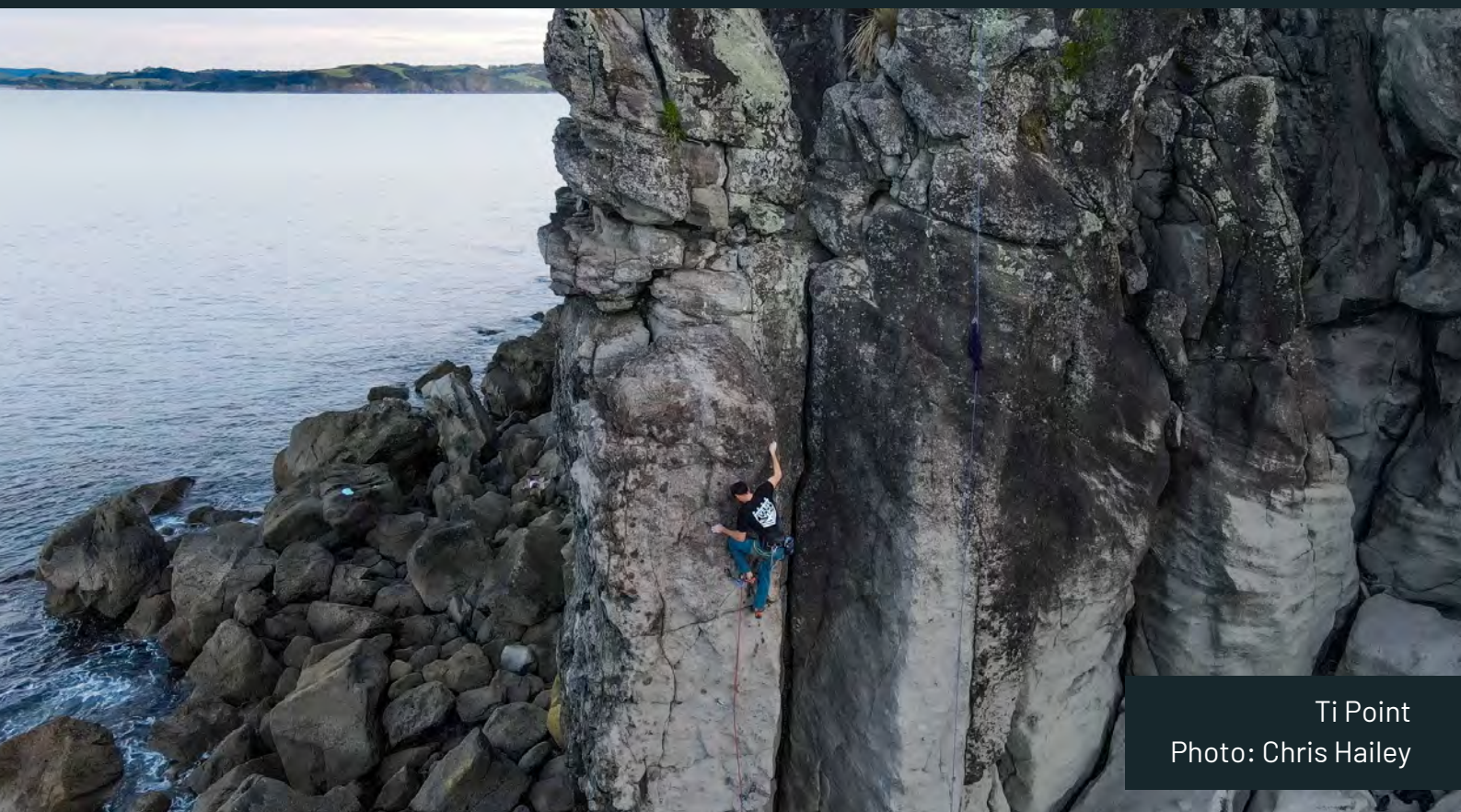
Ti Point