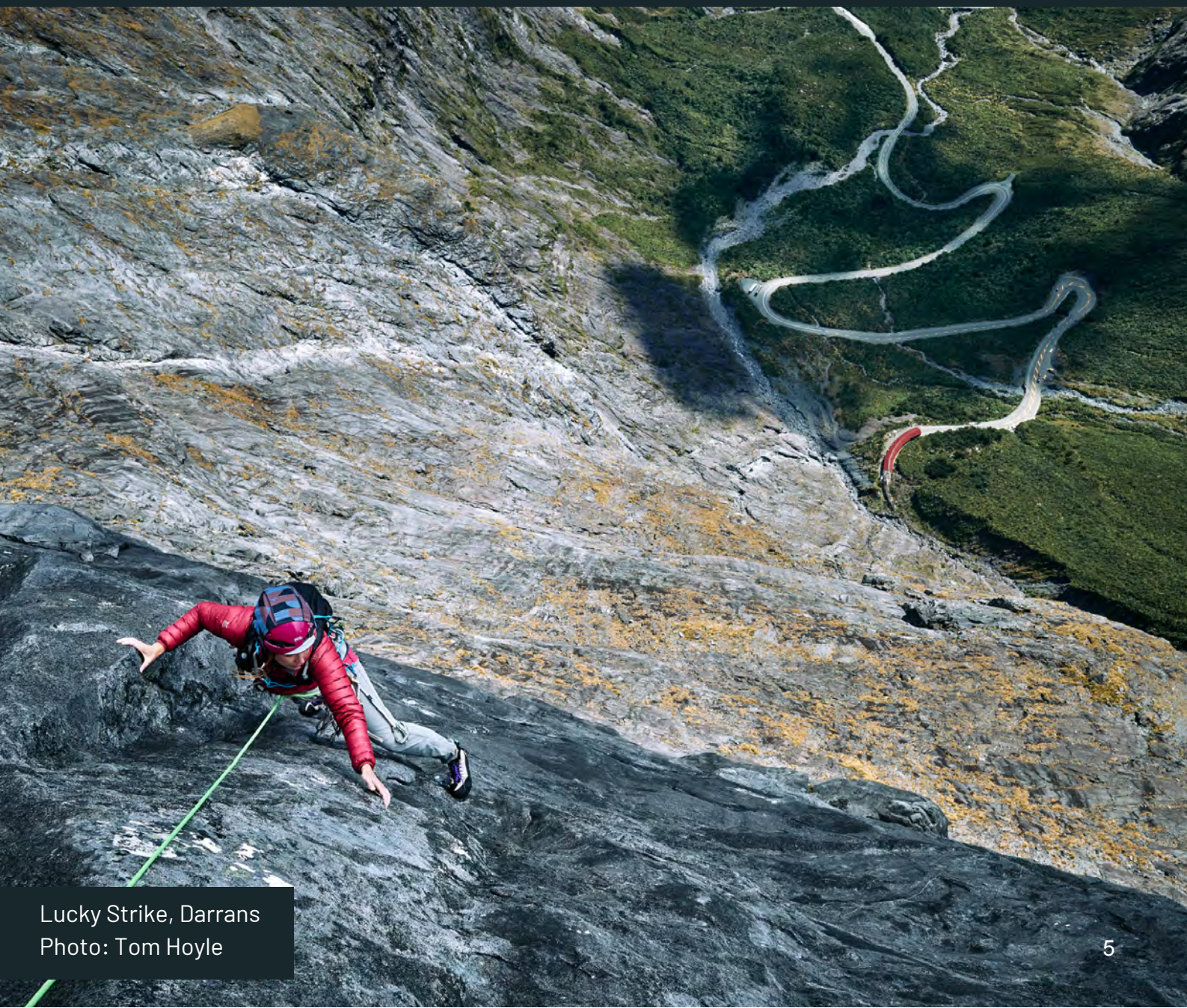
Lucky Strike, Darrans