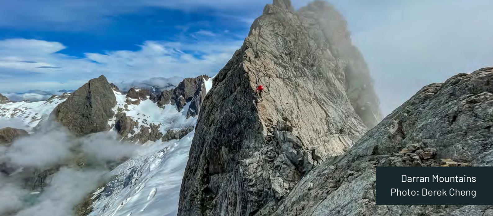
Darran Mountains